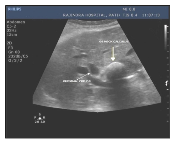
Fig 4a: Ultrasonography abdomen showing an echogenic mass with distal acoustic shadow in the cystic duct region/neck of the gall bladder. Proximal dilatation of common bile duct present.