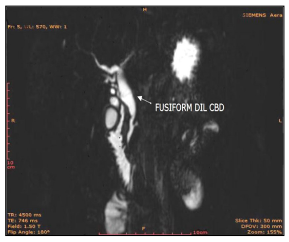
Fig 3b: MRCP T2 SPACE coronal sequence showing fusiform dilatation of common bile duct and distal common hepatic duct in a case of Type1 choledochal cyst.