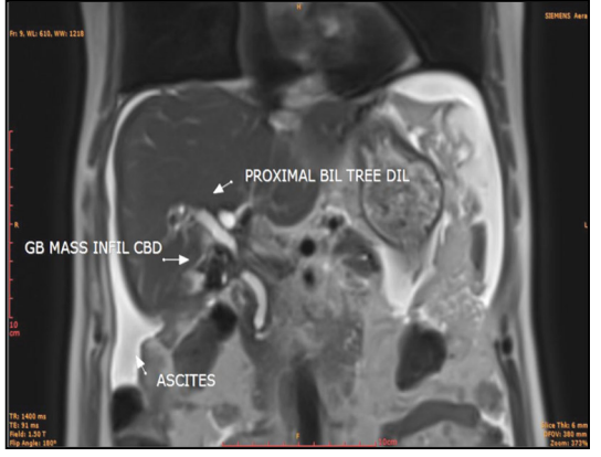
Fig 2b: MRCP T2 HASTE coronal sequence in a case of carcinoma gallbladder showing an ill defined hypointense mass in gall bladder fossa region which is infiltrating into the common bile duct.Proximaldilataion of the biliary tree also seen.