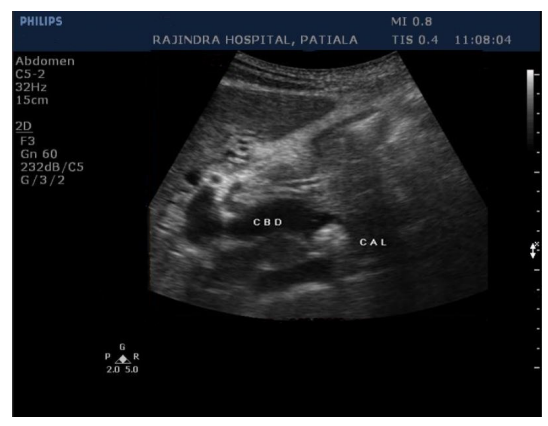
Fig-1a: Ultrasonography abdomen showing dilated common bile duct (CBD) & intrahepatic biliary radicles and echogenic focus (cal) giving acoustic shadowing indicative of calculus.