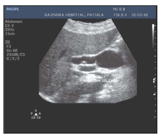
Fig 3a: Ultrasonography showing a fusiform dilatation of common bile duct.