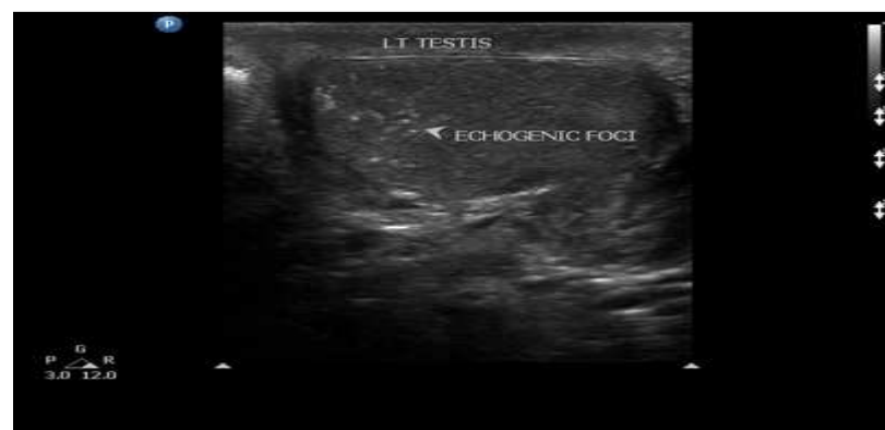
Figure 4 : Multiple small non-shadowing hyper echoic foci are seen within left testicular parenchyma indicating left testicular microlithiasis.