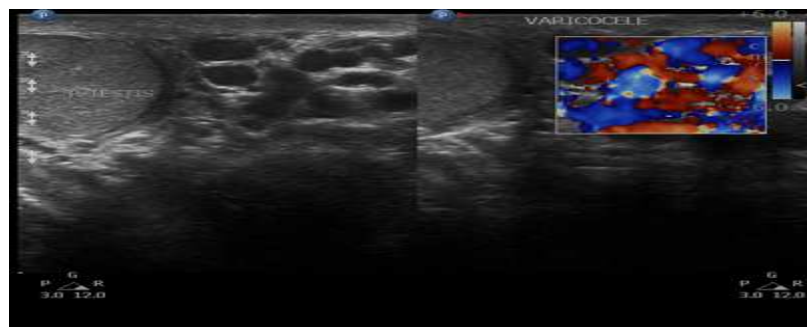
Figure 1: Multiple dilated tortuous anechoic tubular channels are seen posterior to both testis. Flow seen in dilated vessels which increases on Valsalva indicating bilateral varicocele.

The clinical palpation when compared to ultrasound was found to be have a sensitivity of 58.33% and a specificity of 92.31%. The positive predictive value was found to be 87.50% and negative predictive value 70.59%.