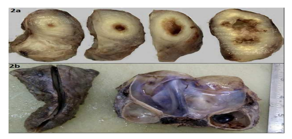
Figure: (2.) 2a. Right tubo-ovarian mass: Single thick walled tubular structure, 6 cm in length. Lumen of varying diameter, filled with necrotic material. 2b.Uterus with cervix and stumps of fallopian tubes; Left ovary - enlarged & cystic; cut surface- 2 cysts measuring 6x6x4cm and 3x3x2cm with smooth wall