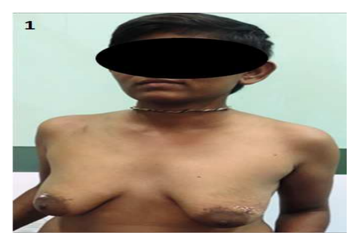
Fig 1: Bilateral gynaecomastia

A karyotyping study was done and the patient showed 46, XX karyotype. The patient was counselled but was lost to follow-up.