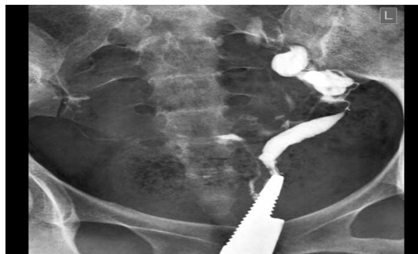
Fig-4: Unicornuate uterus with normal spillage left