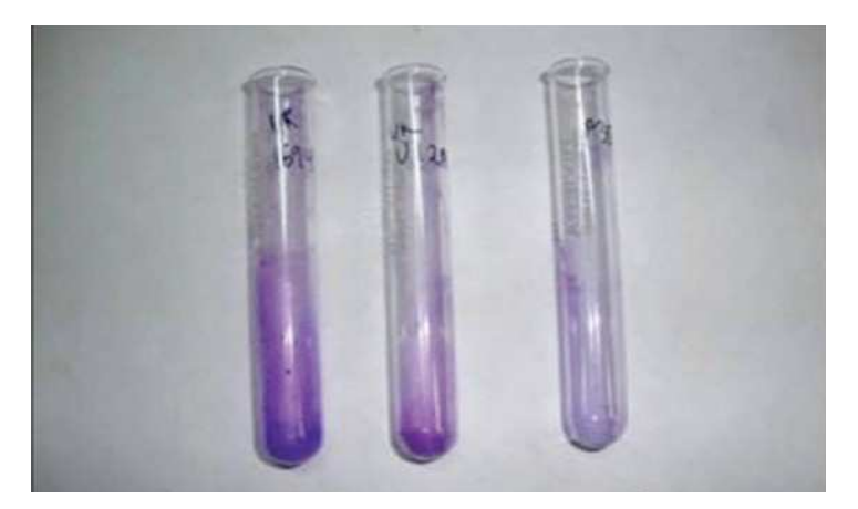
Fig-2: Tube test method for biofilm detection