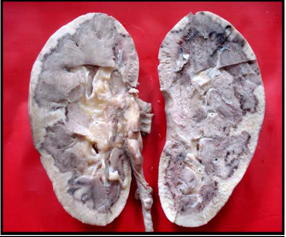
Fig-1: Gross morphology showing creamy-white, diffuse areas of cortical necrosis seen on the external and cut surface of the kidneys in a case of rejection of renal allograft