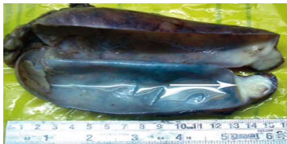
Figure-3: Gross of cholangiocarcinoma showing whitish mass at neck of gall bladder