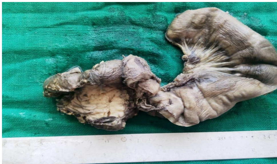
Figure-1: Gross appearance of pancreatic carcinoma showing the tumor mass protruding in tubular lumen