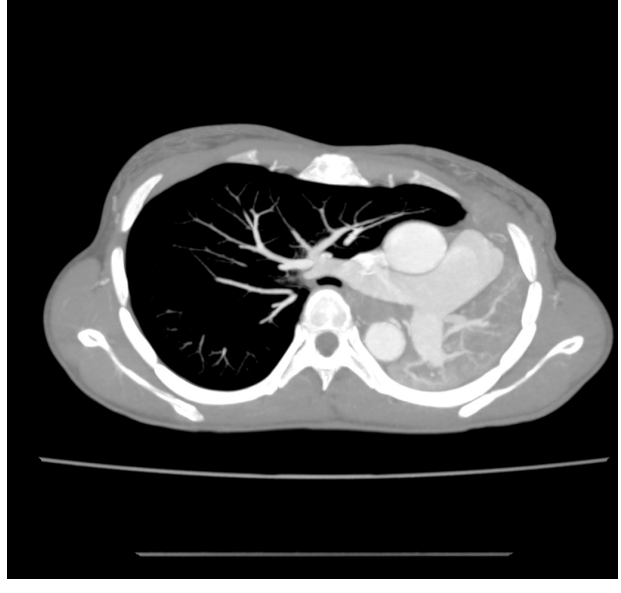
Figure 2: CECT of the chest showing hypoplastic left lung and displacement of the mediastinum to the left side.