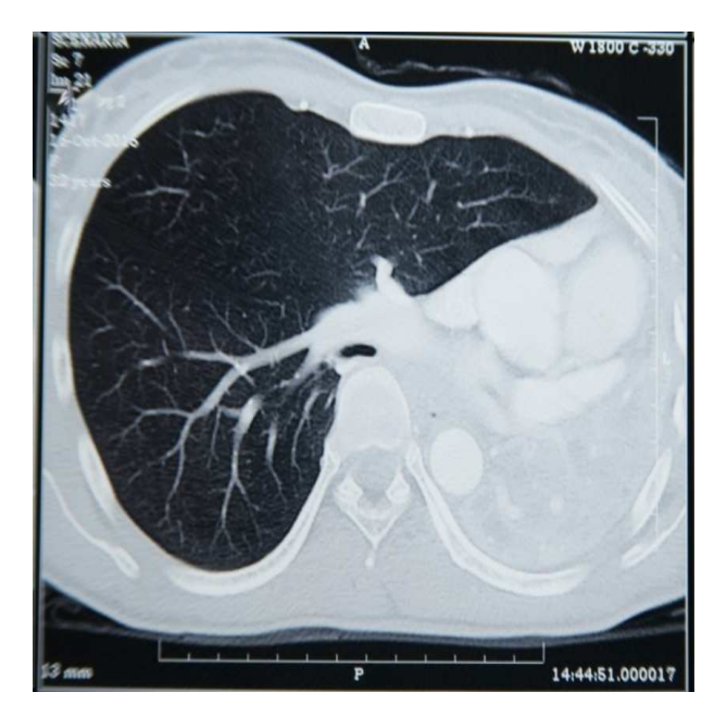
Figure 3: CECT of the chest showing hypoplastic left lung and displacement of the mediastinum to the left side.