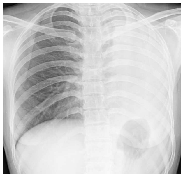
Figure 1: Postero-anterior chest radiograph showing opacification of the left hemithorax and shift of the mediastinum to the left.

hacking in nature accompanied with scanty mucoid expectoration. There was no history of haemoptysis or chest pain. There was no history of breathlessness. In the family history, the patient is married and having two children. She was moderately built and nourished. Clinical examination of the chest showed that there was retracted left hemi-thorax with diminished movements. Trail sign was positive revealing marked shifting of trachea on the left side. Apex beat was felt in the mid axillary line on the left side. On percussion, resonant note was present in right hemi thorax and left supramammary and supra-scapular regions while dull note was present in left mammary, infra-mammary, axillary, infra-axillary, inter-scapular and infra-scapular regions. On auscultation, normal vesicular breath sounds were present in right hemi-thorax. Broncho-vesicular breath sounds were present in left supra-clavicular, infra-clavicular and supra-scapular regions. Breath sounds were absent in left mammary, infra-mammary, axillary and infra-scapular regions.