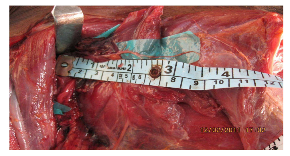
Fig-4: length of medial pectoral nerve approx.8cms

Inclusion Criteria: All the cadavers dissected were male, age ranging from 35 - 60 years Exclusion Criteria: Females and children were excluded from the study.