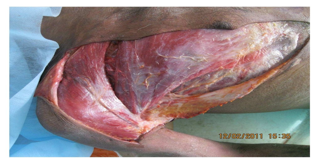
Fig-1: Incision marking

humeral insertion of pectoralis major muscle was transected the medial and lateral pectoral nerves were explored and traced upto their origin from medial and lateral cords.