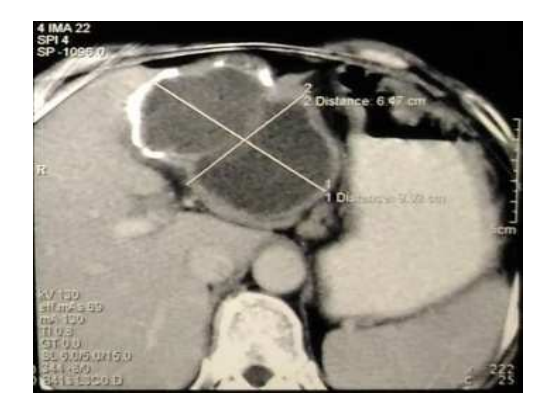
Figure 5: Multi-vesicular Hydatid Cyst in Left Hepatic Lobe with Partial Wall Calcification.