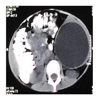
Figure 3 (a,b,c): Simultaneous hepatic (Multicystic) and splenic hydatid involvement.