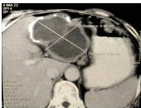
Figure 5: Multi-vesicular Hydatid Cyst in Left Hepatic Lobe with Partial Wall Calcification.