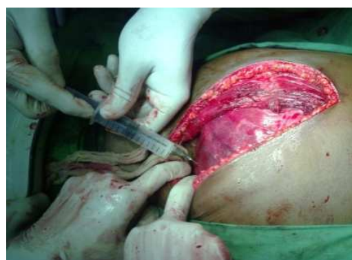
Figure 6: “AIR” Technique