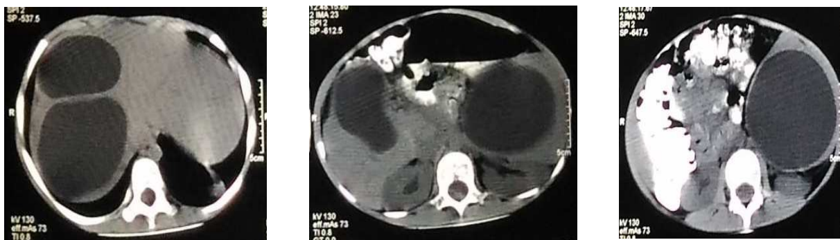
Figure 3 (a,b,c): Simultaneous hepatic (Multicystic) and splenic hydatid involvement.