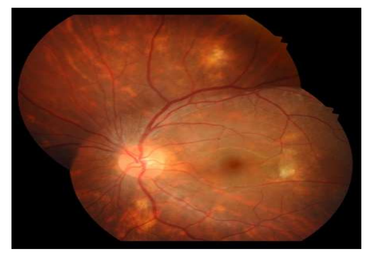
Figure-4: Fundus picture after one month of ATT with complete resolution of disc edema, choroidal abscess and the choroiditis patch