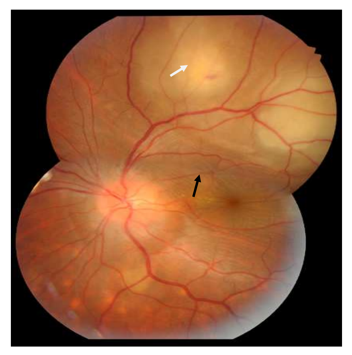
Figure-1: Showing Disc edema, an active choroiditis lesion (white arrow) superiorly with an elevated subretinal abscess (black arrow) and ILM folds at the macula.

B scan of the left eye revealed an elevated lesion with sub retinal fluid and minimal exudative retinal detachment with choroidal thickening. Optical Coherence Tomography also revealed subretinal fluid. Based on these features a diagnosis of tuberculous choroidal abscess was made.