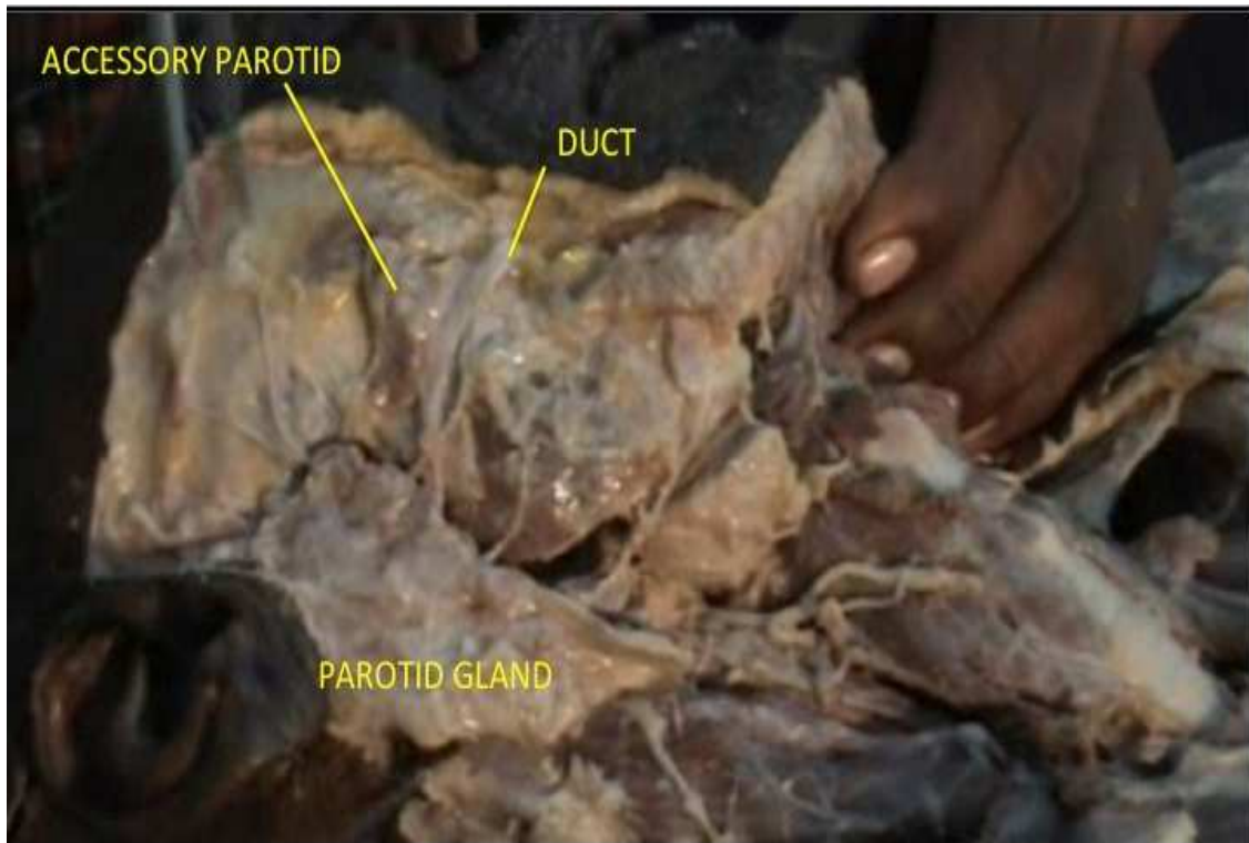
Fig-1: Showing accessory parotid above the stenson’s duct separate from main parotid gland

gland was observed on right side lying on parotid duct detached from the main mass of the parotid gland. In case 2, accessory parotid (Figure 2) was observed lying on parotid duct and here gland has two different ducts draining separately.