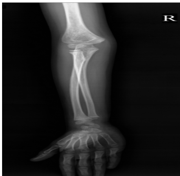
Fig-4: The radial head and medial epicondyle is seen in this 7 year old boy