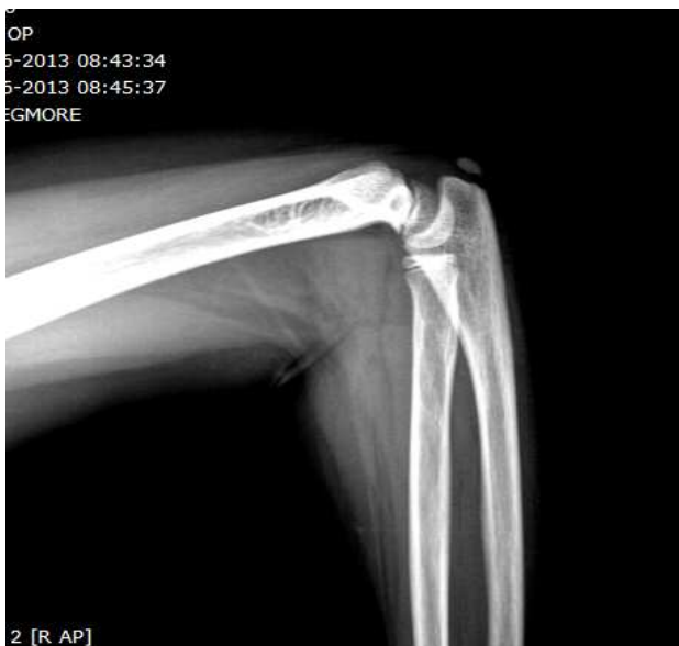
Fig-3: Olecranon centre in a 11year old girl