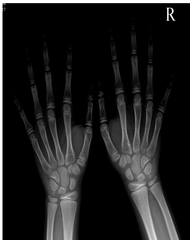
Fig-2: The pisiform is seen in this 10 year old girl