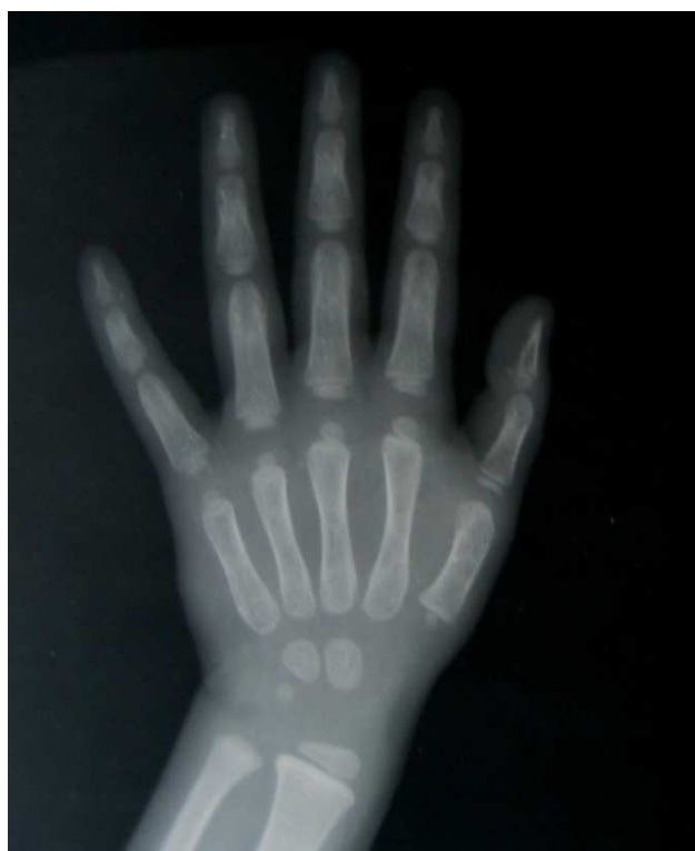
Fig-1: The first metacarpal is seen in this 3 year old