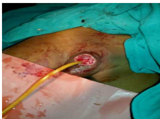
Figure-2: Picture showing total penectomy