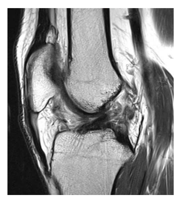
Fig.-1: Complete ACL tear

Diagnosis of ACL Tears: The primary sign of ACL tear is fibre discontinuity which was best observed in the oblique sagittal plane proving most helpful in diagnosing ACL tears. The empty notch sign on coronal imaging was a frequent finding in complete ACL tear [10]. Bone contusion was very common in ACL tears (Figure 1). [9].