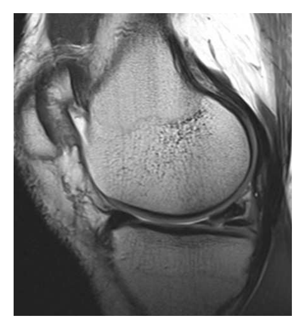
Fig.-2: Complex medial meniscal tear

In acute or sub-acute injury, thickening and oedema of the ACL was found characterized by increased signal intensity on T2 or PD with fat sat weighted sequences. In chronic cases the fibre were completely or partially thinned out.