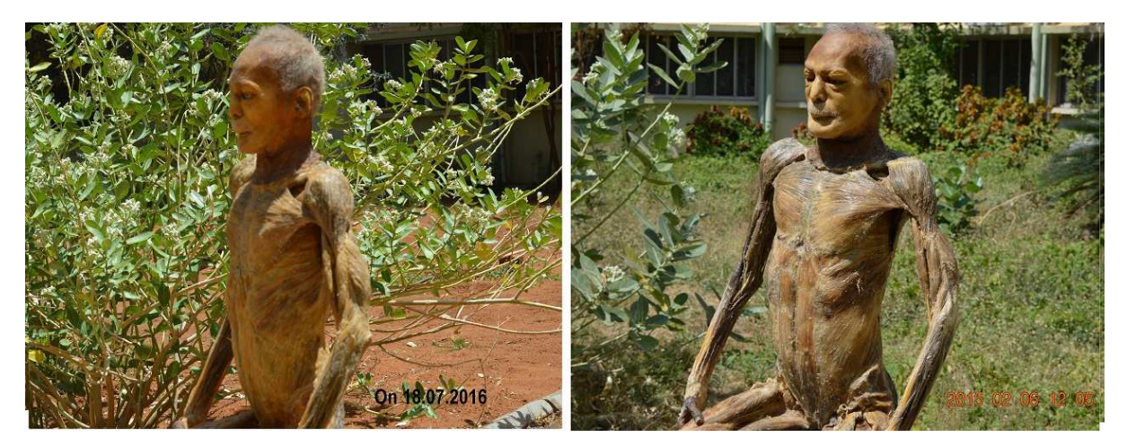
Figure-4: Plastinated whole dissected body

Dehydration at -25°C and force impregnation by supplying vacuum at low temperature (-10°C) are the original protocols for silicone plastination. Dehydration at -25°C will prevent shrinkage of tissues [11]. Similarly forced impregnation by vacuum must also be done at low temperatures inside an explosion proof deep freezer, to avoid quicker hardening of the polymer and curing agent mixture [12]. Both dehydration and forced impregnation by vacuum can also be done at room temperature. This technique is called as room temperature plastination. Room temperature plastination was originally developed in china with the use of Su Yi Chinese silicone polymer developed in 1995 and later in USA in the year 2007. In all types of silicone plastinations after impregnation by vacuum, curing must be done by exposing the body to a gas inside a closed glass chamber. But in the present study to reduce the cost, curing was done simply by exposing the body to sunlight.