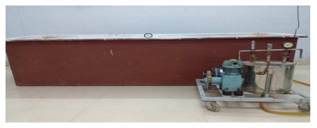
Figure-3: Vacuum chamber

Vacuum application- After complete dehydration, the body was immersed in a mixture of silicone polymer and curing agent mixed in the ratio of 100:1 in a steel container and kept at room temperature for a period of 24 hours. At the end of 24 hours the specimen immersed in the polymer bath was placed inside a vacuum chamber and the chamber was connected to a vacuum pump. The vacuum chamber was designed locally to reduce the cost (figure-3). Vacuum was applied slowly starting from morning and completed in the evening (when a pressure of -20 mmHg was obtained). This process of applying vacuum from morning to evening was repeated for a period of one week.