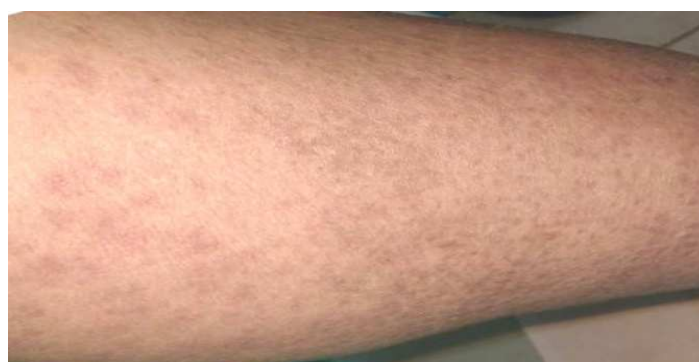
Figure-4: Skin showing resolution of purpura and post-inflammatory hyperpigmentation after 10 days