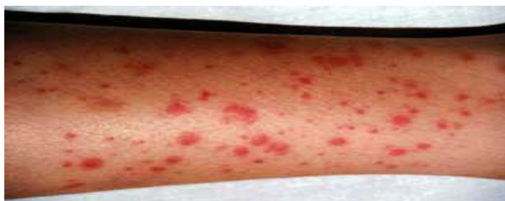
Figure-1: Multiple palpable purpura in left lower limb at admission.

A 54 years old woman presented to our emergency room with complaints of right lower abdominal pain and vomiting for 7 days and hematochezia for past two days. She had high grade fever and arthralgia for two days before admission. She is hypertensive since two years for which she was on amlodipine 5mg once a day. On physical examination, the vital signs were as follows: temperature-37.5 degree celsius; heart rate-94/min; respiratory rate- 20/min; blood pressure-120/74mm Hg. Multiple non blanchable non itchy palpable purpuric lesions were noted in both the lower limbs as shown in Figure 1. The abdominal examination was significant for tenderness and pain in the right lower quadrant upon palpation. There was no rebound tenderness or muscle rigidity. Bowel sounds were present. The remainder of the physical examination was normal.