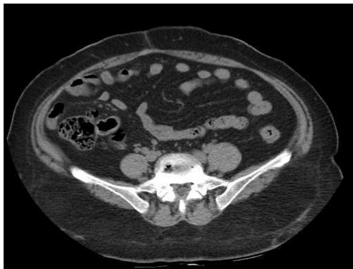
Figure-2: CT Abdomen showing circumferential thickening of distal ileum