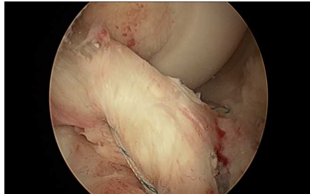
Fig 4: Tibial spine in anatomical position after proper tying of both the ultrabraid sutures.

Rehabilitaion Protocol: Earlier rehabilitation is crucial as it helps in faster recovery and prevention of secondary complications like arthro-fibrosis and loss of extension. Patient's knees were kept in extension with the help of knee immobiliser. Day after surgery range of motion exercises and hamstring stretching exercises in prone position was promoted. Non weight bearing walking was allowed as soon as the pain subsided.