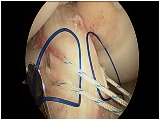
Fig 3: Ultrabraid sutures shuttled through both PDS sutures and taken out for tying