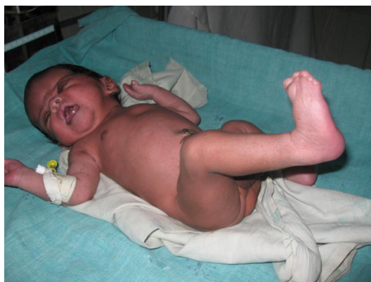
Fig 2: Syndactyly with Sock foot

The baby has severe symmetrical syndactyly of all the fingers and toes, radial deviation of short broad thumbs and contiguous nail beds (Synonychia) of the middle and ring fingers. The syndactyly was marked and resembled 'mitten hand' and 'sock foot' (fig. 2 and 3).