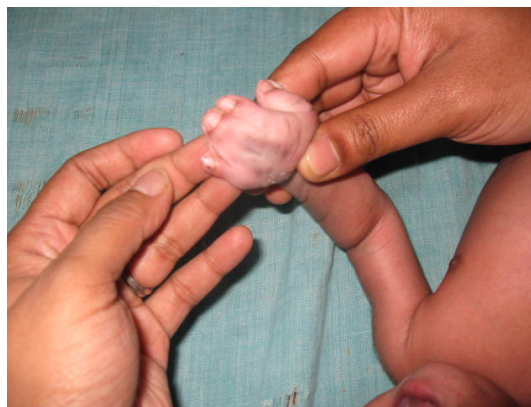
Fig 3: Syndactyly in hands with synonychia

There was a flexion deformity of the elbows with flexion deformity of both hands. The palmar aspect was spoon shaped. The feet showed a varus deformity with syndactyly of all toes and Synonychia. The other systems showed no abnormality. Roentgenographic examination of the bony skeleton revealed an acrocephaly with fusion of the metacarpals at their proximal ends and the terminal phalanges at their distal ends. CT scan of whole body shows no other abnormalities.