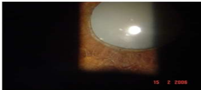
Figure -4: Steroid induced cataract following scleritis treatment.