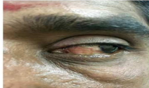
Figure -2: Sectoral congestion in scleritis.