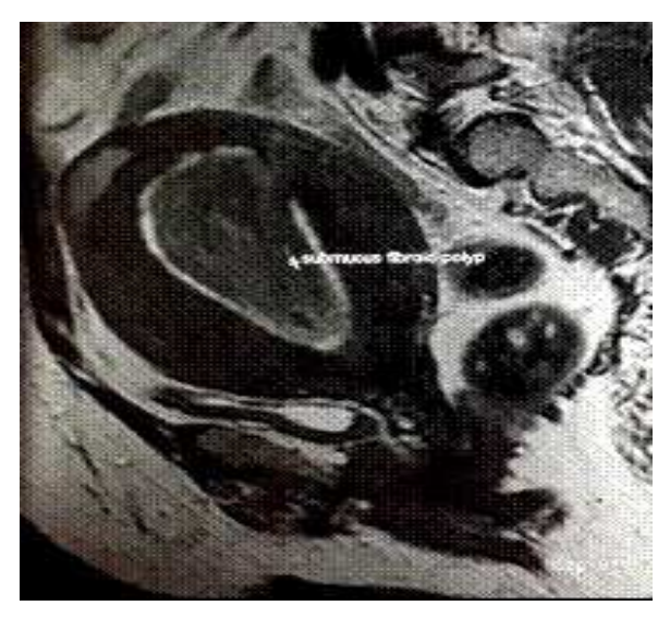
Fig -2.Submucous fibroid polyp detected on MRI

MRI was 100 % sensitive in diagnosing fibroids as compared to USG. Fibroid mapping could be more accurately done, especially submucus fibroids were better identified on MRI and more fibroids could be identified in the MRI scan than on USG.