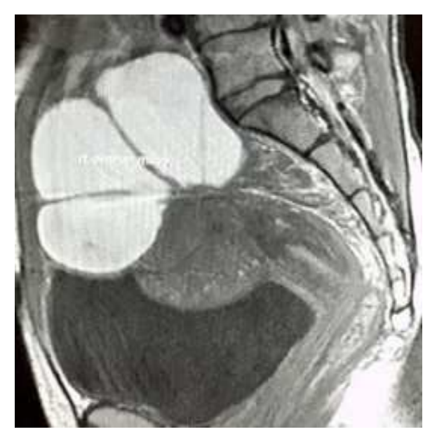
Fig-4.Endometriotic cysts with hemorrhage on MRI, T1Wi sagittal sequence

Studies have shown that MRI can be very useful in patients in whom ultrasound findings are equivalent and in carefully selected high risk population. It is especially beneficial in identifying endometriomas, adhesions, superficial peritoneal implants and extraperitoneal lesions, particularly those in the recto vaginal pouch and uterosacral ligaments as well as in solid endometriotic nodules.