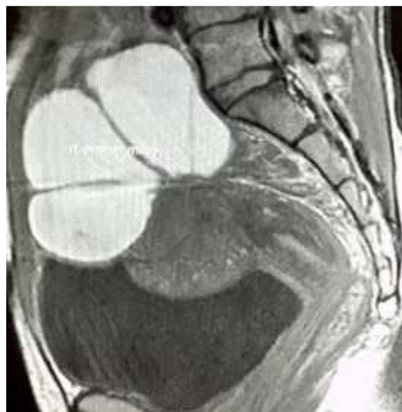
Fig-4.Endometriotic cysts with hemorrhage on MRI, T1Wi sagittal sequence

Studies have shown that MRI can be very useful in patients in whom ultrasound findings are equivalent and in carefully selected high risk population. It is especially beneficial in identifying endometriomas, adhesions, superficial peritoneal implants and extraperitoneal lesions, particularly those in the recto vaginal pouch and uterosacral ligaments as well as in solid endometriotic nodules.