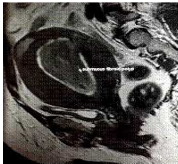
Fig -2. Submucous fibroid polyp detected on MRI

MRI was 100 % sensitive in diagnosing fibroids as compared to USG. Fibroid mapping could be more accurately done, especially submucous fibroids were better identified on MRI and more fibroids could be identified in the MRI scan than on USG.