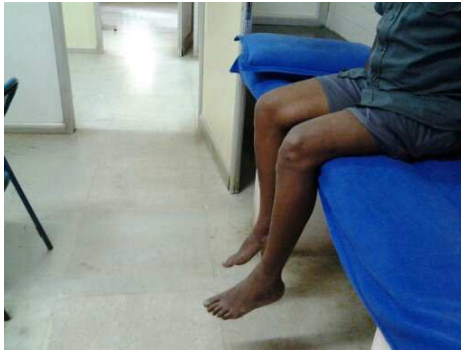
Fig.11: Knee flexion

Rehabilitation: Long knee brace was given for three weeks after surgery with gradual to partial weight bearing with the brace. Range of motion of the knee and isometric muscle exercises were started the day after the operation and gradually progressed on the basis of closed kinetic chain exercises. Knee flexion of more than 90° and walking with full weight bearing was allowed 15 days postoperatively.