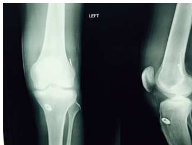
Fig.13: Postoperative radiograph

All the patients were examined at 3, 6, 12, and 24 months after surgery as well as at the latest follow-up. The clinical assessment involved the number of operative revisions and complications at the longest follow-up, the objective criteria of the International Knee Documentation Committee (IKDC 1999) [9] and Lysholm and Gillquist knee scoring system [10], Limb Symmetry Index scored by single leg hop test done at 6 months (LSI score) [11], laxity assessment by Lachman test at 12 months. The median hospital stay in our series was 4 days with a range of 3-5 days. Spinal anaesthesia was used in all of our cases. The mean time taken for surgery was 94.5 minutes with values ranging from 70 to 130 minutes.