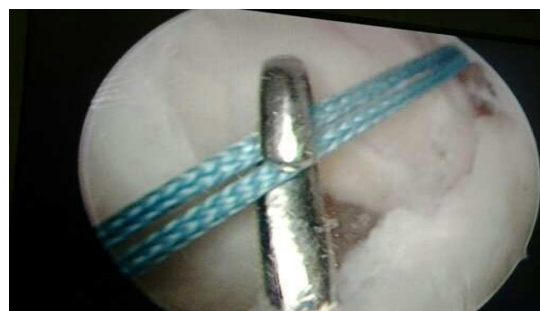
Fig.6: Suture retriever through tibial tunnel pulling the Ethibond out

construct was 8mm in male and 7mm in female patients. Femoral tunnel preparation is done through low placed anteromedial port with knee in maximum flexion (>120degree). Entry point was attained by a 45 degree micro fracture pilot awl. The graduated guide pin was advanced so that it exits the femoral cortex the femoral tunnel length to be reamed was measured and then calculated according to the length of the graft material. We found the average femoral length to be 3.5cms.