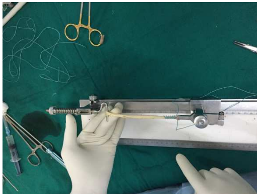
Fig.4: ACL graft master

Initial diagnostic arthroscopy performed via anterolateral and anteromedial ports. Vertical incision about 3cm anteromedially on proximal tibia starting 3-4cm distal to joint line and 3-4cm medially to tibial tuberosity. A Semitendinosus graft used, the gracilis tendon was spared in all the cases. Semitendinosus tendon is more horizontal and lies below gracilis. It is pulled with curved clamp and snared with a braided suture, dissection carried proximally up the thigh. The insertion end of the tendon is held with ethibond suture and the surrounding fibrous extension released and the procured. ACL graft master used for pretensioning and control of tendon (fig.4). The overall length of the tendon is measured.