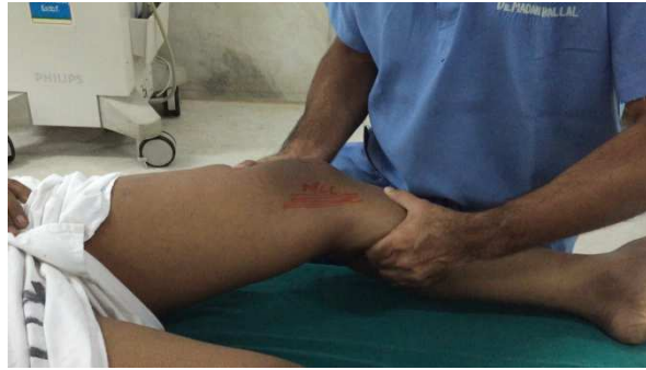
Fig 3: Lachman test

Initial diagnostic arthroscopy performed via anterolateral and anteromedial ports. Vertical incision about 3cm anteromedially on proximal tibia starting 3-4cm distal to joint line and 3-4cm medially to tibial tuberosity. A Semitendinosus graft used, the gracilis tendon was spared in all the cases. Semitendinosus tendon is more horizontal and lies below gracilis. It is pulled with curved clamp and snared with a braided suture, dissection carried proximally up the thigh. The insertion end of the tendon is held with ethibond suture and the surrounding fibrous extension released and the procured. ACL graft master used for pretensioning and control of tendon (fig.4). The overall length of the tendon is measured.