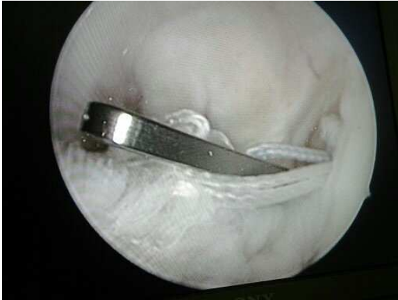
Fig.7: Endobutton entering femoral tunnel

Using the appropriate diameter reamer, the femoral tunnel is reamed based on graft size. A no.5 Ethibond suture was attached to graduated guide pin is passed through anteromedial portal to the femoral tunnel exiting lateral aspect of thigh. Tibial guide placed taking the ACL footprint, which is anterior and medial to the anterior horn of the lateral meniscus in the