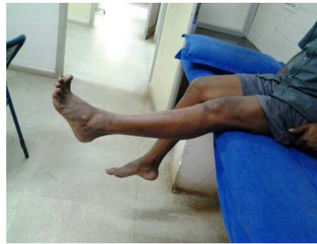
Fig.12: Knee extension

Indoor cycling and swimming were permitted after six weeks and running after 12 weeks. High demand pivoting sports activities were allowed after approximately 12 months.