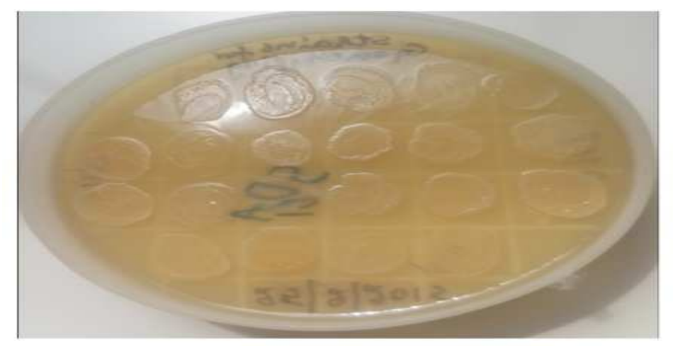
Figure I: Shows the different tests used in characterization of Methicillin resistant Staphylococcus aureus

Methicillin Resistant Staphylococcus aureus on Oxacillin Screen Agar