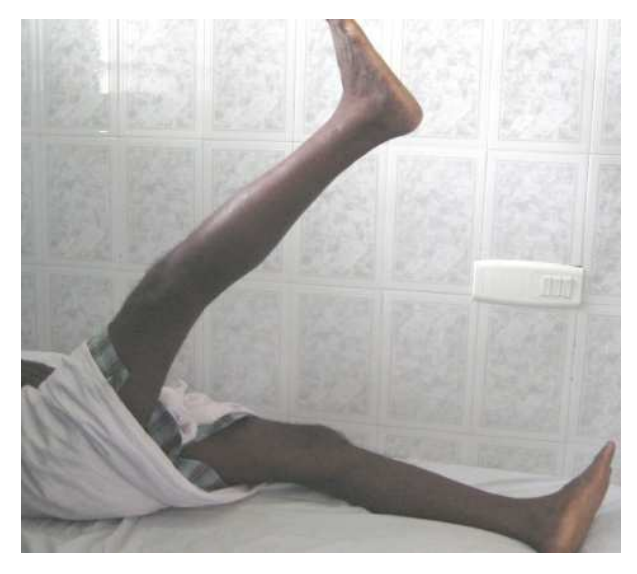
Fig.10: Good functional outcome

The average operative duration in our study was 50 minutes with the longest duration being 75 minutes and the shortest being 45 minutes. This is similar to the study of Pajarinen et al [8], and significantly lower when compared to the study of Morihara (77 minutes) [9]. The average intra-operative blood loss in our study was 300 ml, which is almost similar to the study of Pajarinen et al (320ml) [8]. The average time for radiological union was 12 weeks. Varus mal-union was seen in 3 patients. Shortening was observed in 1 patient which was less than 2 cm and not significant. We did not encounter any infection, non-union, delayed union or implant failure in our study. Based on Kyle's criteria for functional outcome, 96% (22 patients) of the patients has excellent to good results (Fig.10).