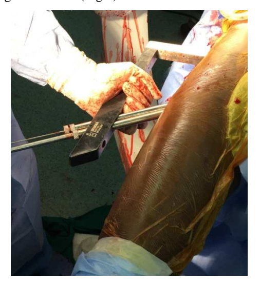
Fig 6: Insertion of the cervical lag screw