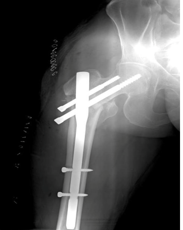
Fig 8: Immediate post operative X-Ray Fig 9: Fracture united at 12 weeks