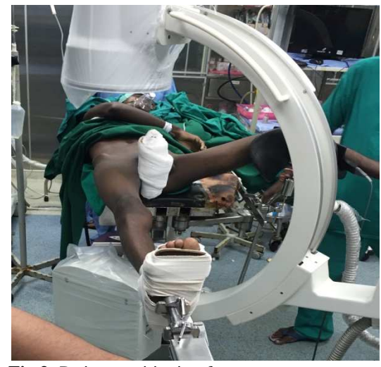
Fig 3: Patient positioning for surgery.