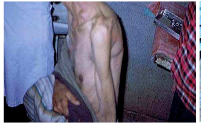
Fig 1: Swelling in left supraclavicular region (tubercular) (hemangiopericytoma)