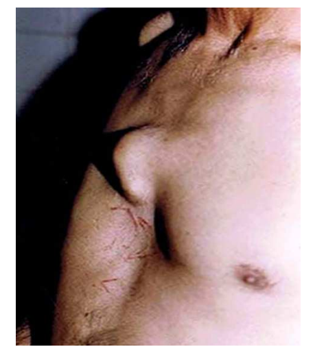
Fig 4: Swelling over lower part of sternum (Chondrosarcoma)

Excision biopsy helped in making the diagnosis, and 39 patients (79.59%) were definitely helped by accurate diagnosis, and specific treatment, besides diagnosis also helped in convincing these patients to go for treatment at higher centers.