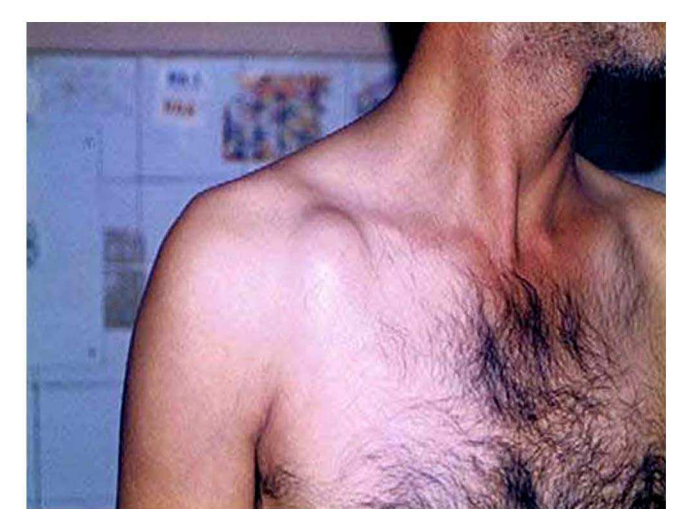
Fig 3: Swelling in right infraclavicular region (Immediate grade fibrosarcoma)