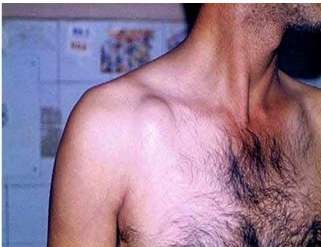
Fig 3: Swelling in right infraclavicular region (Immediate grade fibrosarcoma)