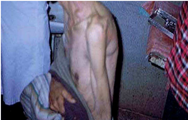
Fig 1: Swelling in left supraclavicular region (tubercular) (hemangiopericytoma)