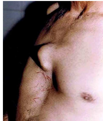
Fig 4: Swelling over lower part of sternum (Chondrosarcoma)

Excision biopsy helped in making the diagnosis, and 39 patients (79.59%) were definitely helped by accurate diagnosis, and specific treatment, besides diagnosis also helped in convincing these patients to go for treatment at higher centers.