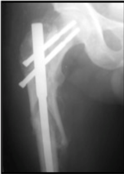
Fig 3: 6 weeks follow up X-Ray