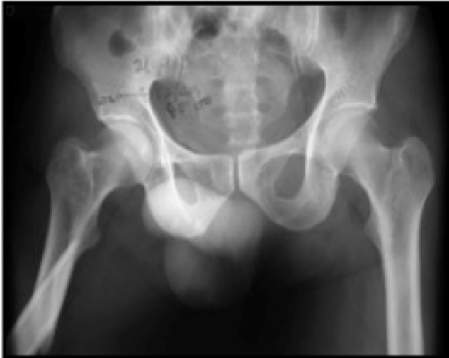
Fig.1: Pre-operative X-Ray

All traumatic sub-trochanteric fractures treated with Titanium Reconstruction nail were included in the study. (Figs.1, 2)