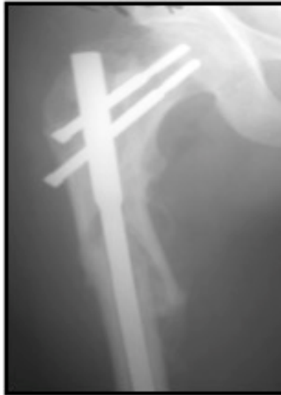
Fig 4: 12 weeks follow up X-Ray