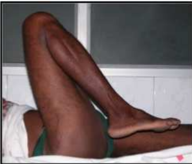
Fig.6: Full range of hip flexion