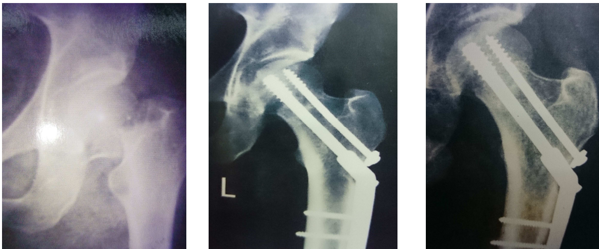
Figure 2 : Pre-op X ray