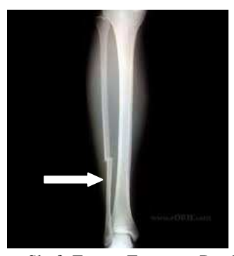
Fig 1 & 2: Inter-trochanteric Femur Fracture, Subtrochanteric Femur Fracture, Shaft Femur Fracture, Patella Fracture, Shaft Tibia fracture, Isolated Fibula Fracture

Intertrochanteric and Subtrochanteric Femur fractures were managed primarily by anklet skin traction and then X rays of the limb were conducted (Figure 1,2).