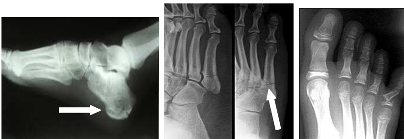
Fig 3: Calcaneal fracture, fracture of fifth metatarsal, Fracture of 5 th toe proximal phalynx

Patients with shaft femur fractures were monitored vitally for shock management due to frequent severe blood loss in such injury. Two wide bore intra-venous cannulas were inserted and fluids and blood were started almost immediately and Bohler splint with ankle traction were given before taking X -rays (Supplemental Figure 2). Patients in severe shock or having complications like fat embolism requiring long term medical care, were managed with upper Tibial Steinman pin traction with one brick and Bohler elevation.