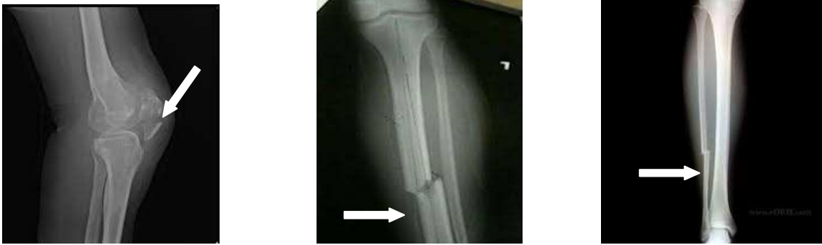
Fig 1 & 2: Inter-trochanteric Femur Fracture, Subtrochanteric Femur Fracture, Shaft Femur Fracture, Patella Fracture, Shaft Tibia fracture, Isolated Fibula Fracture

Intertrochanteric and Subtrochanteric Femur fractures were managed primarily by ankle skin traction and then X rays of the limb were conducted (Figure 1,2 ).