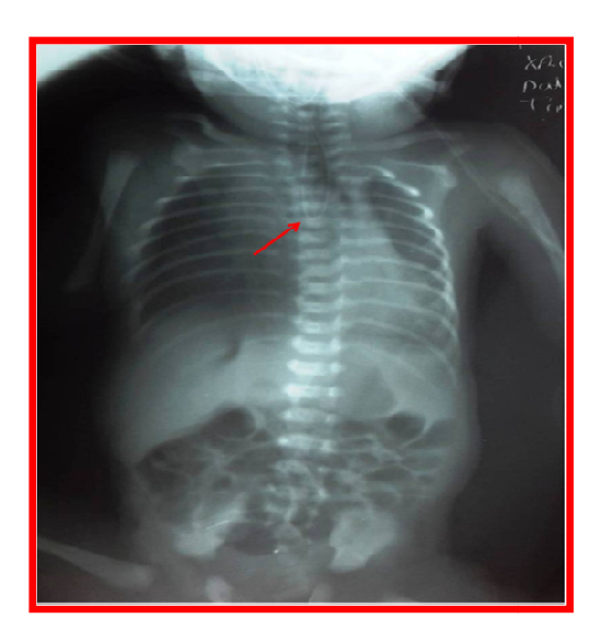
Figure 1: CXR showing coiling of orogastric tube which is blocked from entering the distal esophagus by the esophageal atresia

CT scan Paranasal Sinus, Neck & Chest-Plain with Virtual Bronchoscopy was done which showed soft tissue dense membrane in the posterior choanae.