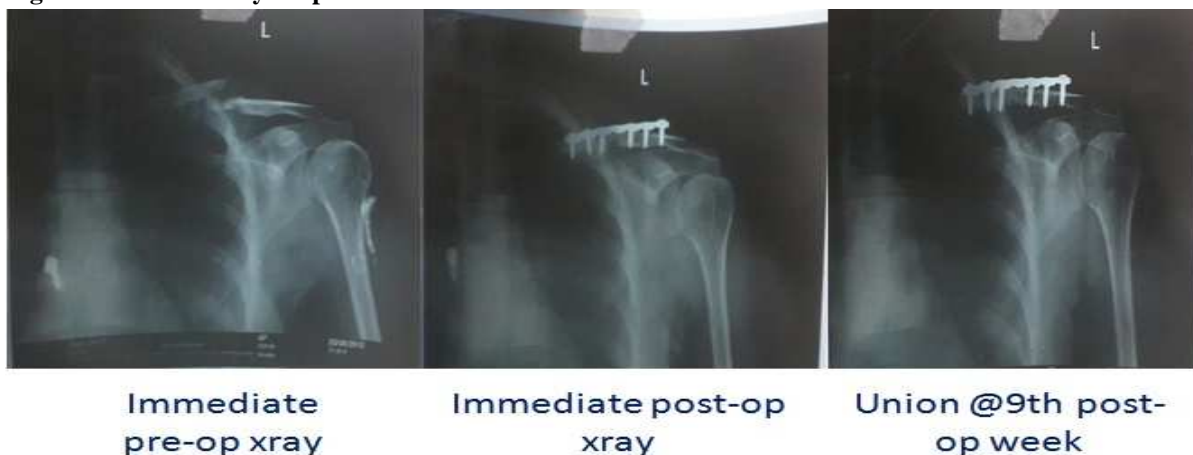
Figure- 1: Serial X-rays of patient

Complications: Major complication: A complication requiring inpatient treatment and resulting in an additional morbidity of 2 months or more was regarded as a major complication [7].