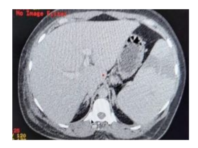
Figure 2: CECT Whole Abdomen showing splenic infarct.