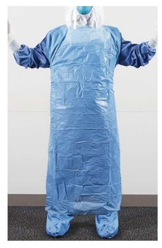
Fig-3: An innovative suite equivalent alternative to a HAZMAT suit. Though it has no