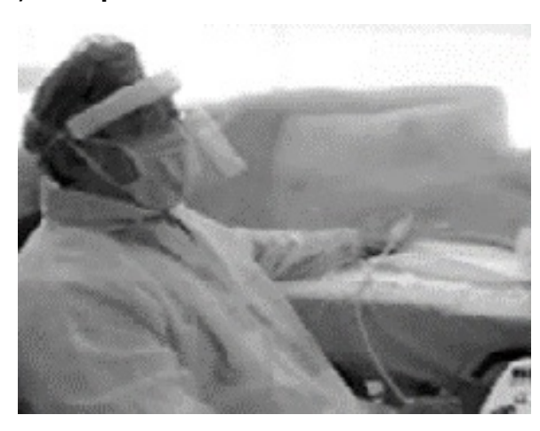
Fig-2. Inadequate Personal protection for operator performing echocardiogram in COVID-19 patient. The illustration shows an echocardiographer with a cap, mask, and face shield with the use of a barrier. This does not constitute appropriate personal protection. Level 1 PPE is mandatory for CCS I or II (see text for details); while Level 2 PP may suffice for CCSI II (see text for details).

Fig-1a: WHO data on cases of COVID 19 worldwide as on 30th March 2020 (From https://www.worldometers.info/coronavirus/, last updated 28 March 2020.