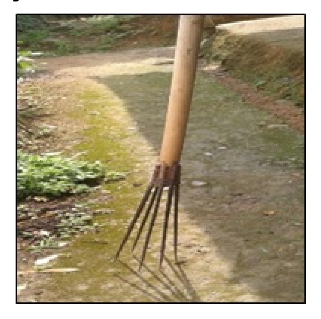
Fig-2: Multipronged spear.

Five (63.3%) patients presented with features of cardiac tamponade or with severe hypotension (systolic BP less than 80 mmHg) and one (16.7%) patient who was haemodynamically stable at the time of presentation had developed features of cardiac tamponade after 24 hours. Clinical presentation at the time of arrival is shown in Table 1.