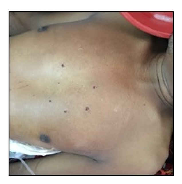
Fig-1: Precordial wounds.