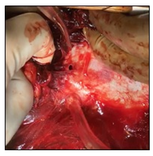
Fig-4: Pericardial injury.

For pericardial injuries, pericardial bleed was controlled with electrocautery and a pericardial window was made both above and below the left phrenic nerve (Figure 4). Right ventricular injuries was repaired with 4-0 prolene and pericardial windows were made both above and below the left phrenic nerve. Right ventricular injuries were repaired without using cardiopulmonary bypass.