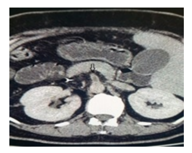
Figure 1: CECT abdomen axial scan depicting short-segment thrombosis of the celiac trunk [arrow]

She was immediately started on continuous intravenous heparin infusion. With now a history of 7 days duration, the possibility of bowel gangrene was high, and the need for open surgery was imminent. Still, due to young age of patient, and an otherwise good general condition, a decision of endovascular management was made.