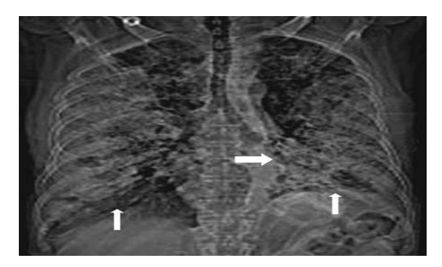
Fig-1: Chest X ray demonstrates diffuse air space opacities involving bilateral lung fields with the fuzzy outline of the left cardiac border (thick white arrow) and bilateral hemidiaphragm outline (thin white arrows).

however the radiological findings remained more or less the same. Eventually the patient scummed to the lung pathology and died nearly seven months after diagnosis. Our case is unique as the disease is seen in a male patient who had no history of smoking, presenting as extensive multilobar disease having a crazy paving pattern with a clear depiction of CT angiogram, air bronchogram, bulging fissure signs and presence of pseudo cavitation.